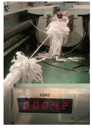
<Mooring rope break test>