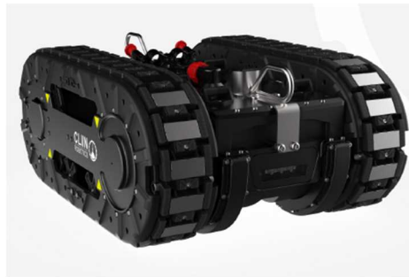
< Hold cleaning robot >