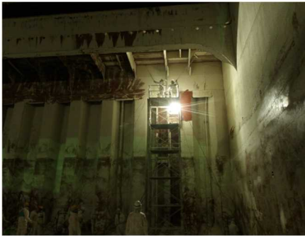
< Crew work at heights for hold cleaning >

We will continue to verify the latest technology and contribute to improving crew safety and work efficiency.