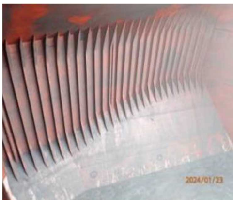
< Before hold cleaning (our management vessel) >