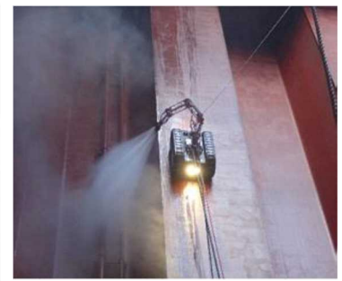
< Robot that washes high pressure water