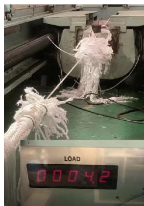
< Mooring rope break test >