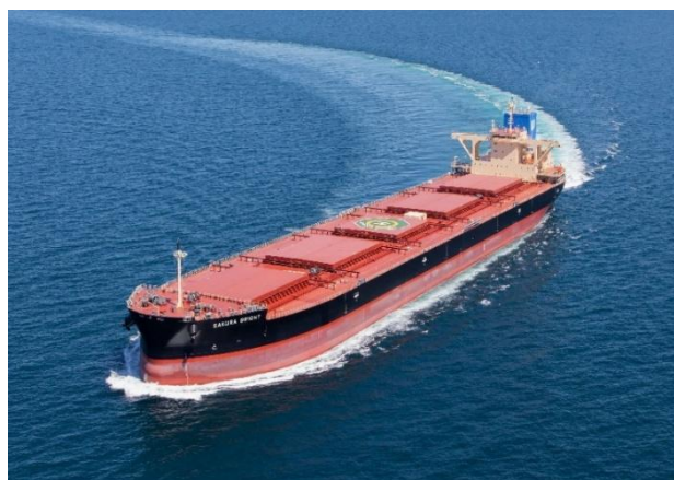
SAKURA BRIGHT used for the demonstration

*Mooring management: Conducting mooring operations to secure a vessel to the berth so that it can safely remain in port, and monitoring/managing the condition of the mooring lines.