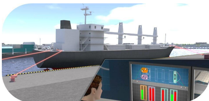
Conceptual image of the system